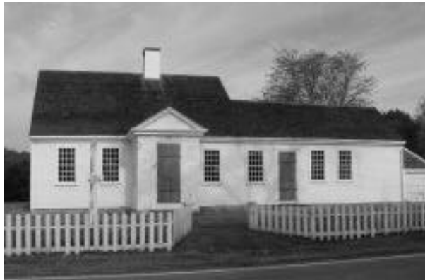
Historic Burgess House on Route 149 in Marstons Mills; built ca 1823.