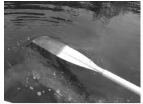
Algal mass on Mystic Lake being examined.

A number of pondwatchers at the northeast end of Mystic Lake all reported seeing floating masses of green algae during the second week of September. These algal masses resembled green cotton candy and were 2-3 feet wide and 4-8 feet long. Some were several feet deep, with a long tail extending down into the water. Photographs were taken of several of these masses, one of which is shown here. Other color photos may be seen on the IPA website ( www.indianponds.org ). Various forms of this algae were evident in Mystic Lake until late October.